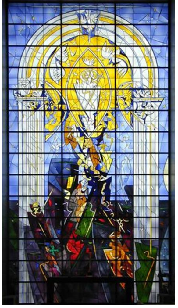
Figure 1. Divine inspration of Thorgeir ljosvetningagodi to accept Christanity in the year 1000 in the Icelandic Alting. Glass vindow and artist vision: Leifur Breidfjord. (Courtesy: Leifur Breidfjord)

All this has to be turned around. A slayer shall turn him in for judgment, and he shall be protected from the avenger until a verdict is proclaimed in his case. Robbery, theft and other mischief is punished according to the retaliation law, lextalionis. The very famous quote is "an eye for an eye and a tooth for a tooth" describes lextalionis very well(Eye for an eye 2015). The religious state of Israel practiced lextalionis as may be seen many places in the Bible. But it was not the only one, Ancient Egypt and Babylon had very much the same system and when Islam took over in these countries, they used lextalionis too and some Islamic countries still do.