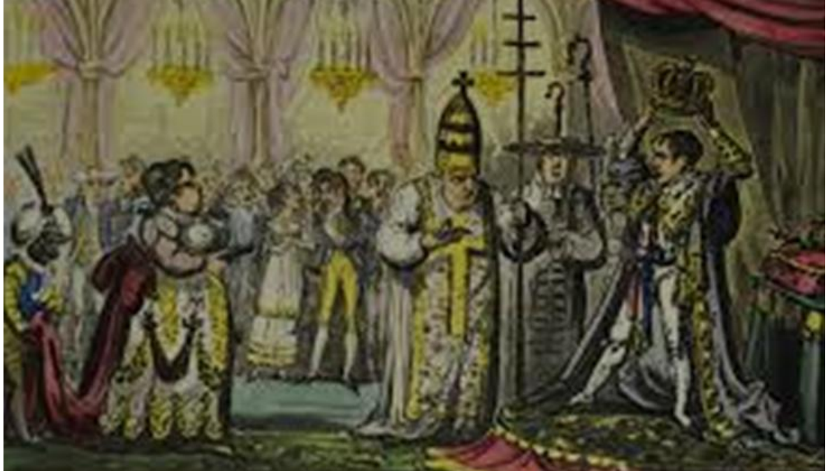
Figure 3 Cartoon of Napoleon snapping the crown from the pope and crowning himself.

and inventors of new weaponry became known. Now theywere presented as thinkers and philosophers and today many believe that they are the founders of modern ethics, an idea that can be traced all the way back to Cicero (Rawson 1983). Nevertheless, it can be safely argued that many of the Greek philosophers were likely influenced by Judaism, both from their own studies and translations of the Old Testament to Greek (Septuagint), as postulated by Judaic scholars (Shurpin 2014)