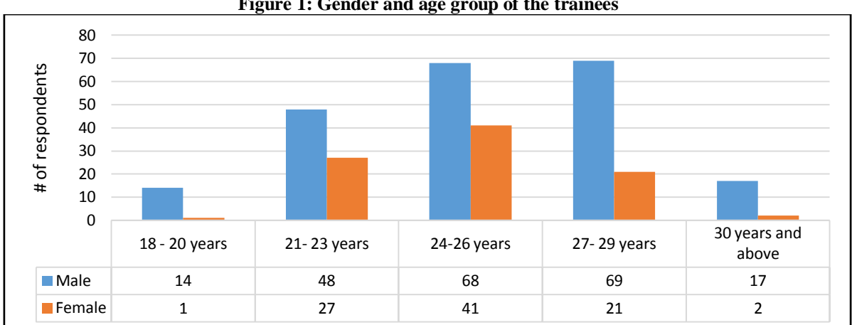
Figure 1: Gender and age group of the trainees

This article will present the findings on the attitudes of the police on policing and citizens. The demography of the respondents will be presented in this section as well.