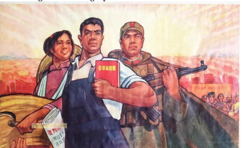
Figure 1: Clothing Style in the Culture Revolution

In this day and age of globalization, Chinese people are wearing what people from other countries wear. However, a new question arises: How have gender norms changed so fast in the recent century? People tend to wear pants and skirts to distinguish a human's gender. Not only clothes but the length of the hair is also considered in gender norms. However, a century ago, the gender norms for men were the skirt and queue. The last dynasty in China was highly corrupted and vulnerable. In the Republic's early years, founded in 1912, the provisional central government ordered a nationwide ban on braids. In the era of significant change at the end of the Qing Dynasty and the beginning of the Republic, cutting the queue was not a matter of personal preference and habit but an irreversible political trend. The cutting off of pigtails meant the end of Manchu alien rule and the abolition of feudal uniforms.