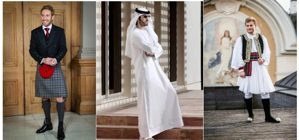
Figure 3: Examples of Scotland, Arab and Greece Men Wearing Skirts

Social life is a performance; people's outfits express their authentic selves or show a part of themselves that they want others to see. People are more inclined to wear what they like when they do not lose the benefit of showing their true selves and ignoring their gender identity. No one would accuse a person of wearing slippers to go grocery shopping instead of going to a formal business party.