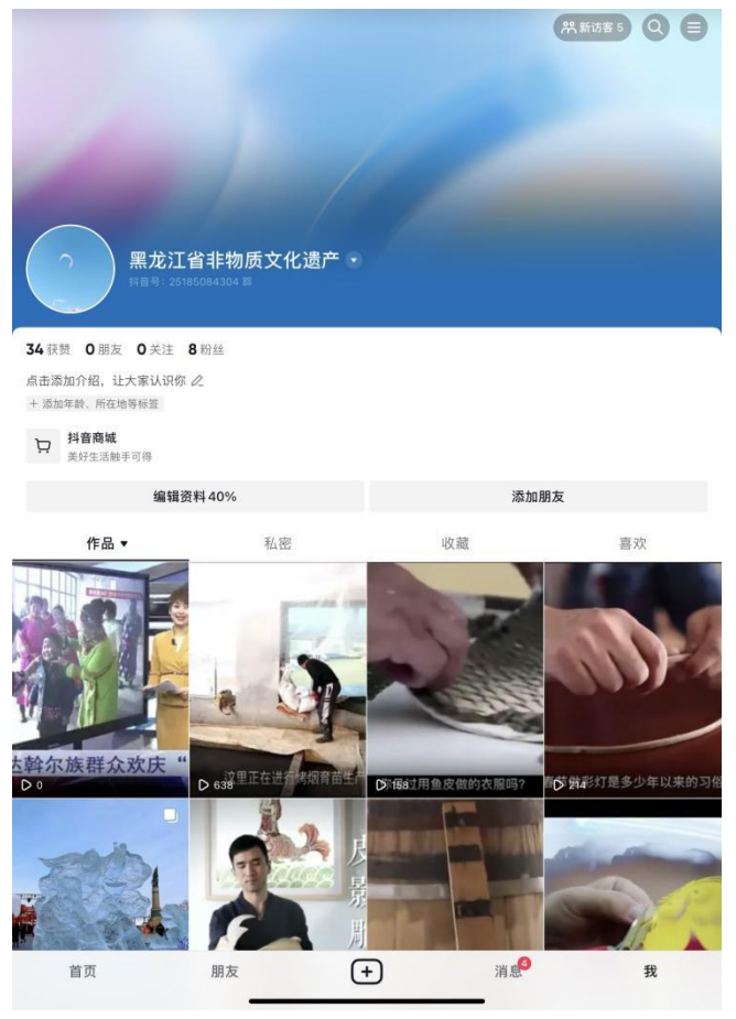
Til Tok platform