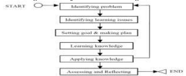
Figure 1. Project-Based Learning Scheme

Apart from meeting users' online demands, such educational paradigms have also changed traditional, top-down class dynamics into more collaborative learning environments. One of the teaching proposals that has grown popular as a model for this collaborative learning environment is Problem Based Learning (Brabazon et al, 2012), with proven results in terms of developing learning, competences and skills (Bender, 2012) through a progressive sequence of learning objectives that include identification of a problem or need, group problem solving and reflective steps. Furthermore, an approach, Project Based Learning, in which students actively explore and collaborate in real-world problems to respond to authentic situations over an extended period of time, fosters the learning process, engages students, and allows for critical thinking (figure 1).