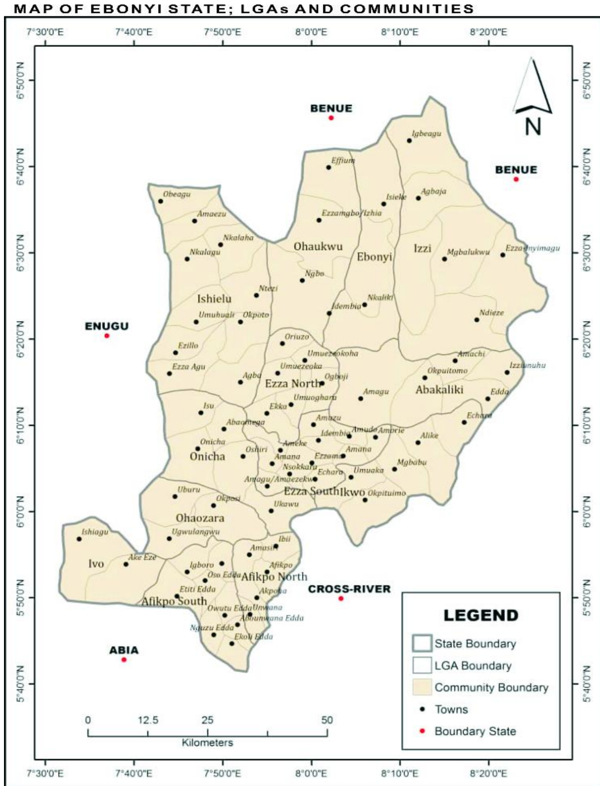
Figure 1 showing Ebonyi State local governments and major communities