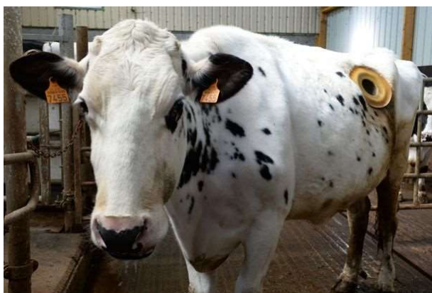
Figure 2 Cow with a hole for research purposes .

The NZAVS (2020) is a society with fundamental principles that people are misled by vivisection and in the name of science and medical field it is represents a fraud and a danger. In other words unethical. NZAVS (2020) argued that, for profits and for industrial use, holes like window shaped are drilled inside cows and they have to live with that their whole lives. It is known as the Fistulation surgery of the rumen. Newby et al. (2014) described in details the procedure of this type of experiment on animals. The Animal Care Committee, University of Guelph provided approval for the study. According to the Mirror (2019), the animal rights group L214 qualified this practice as inhumane and to ban these experiments.