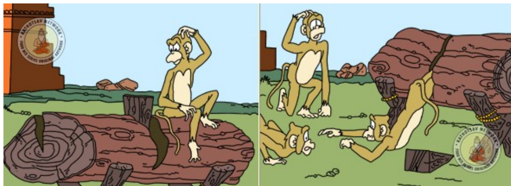
Figure 3 . The Monkey and The Wedge. Source , Tales of Panchatantra, 2021

which are known as Panchatantra Stories. Among these stories are the story of The Monkey and The Wedge (Tales of Panchatantra, 2021). The story goes by as a group of monkeys were watching some carpenters working. At a point, the workers left their work and went away. A monkey was curious and went to touch the work of these workers without their permission. What happened is that the monkey displaced a piece of wood and got stuck in between two heavy pieces of logs. The Panchatantra moral is that "One, who interferes in other's work, surely comes to grief"